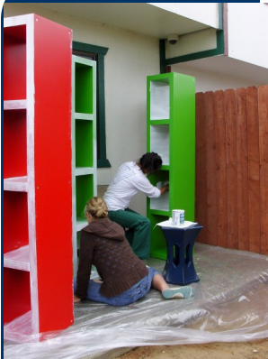
Many volunteers worked to prepare the house