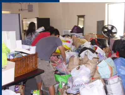
More Volunteer efforts

There are many volunteer opportunities at Freedom House - shelter vol-