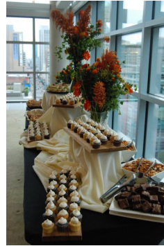
Buffet at Event

The event boasted a beautiful venue, food, entertainers and speeches. Thanks to the many donors that made the