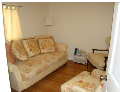
Private Room at Freedom House

Take a look at the pictures of the shelter home on this page. This is the shelter Freedom House provides to survivors.