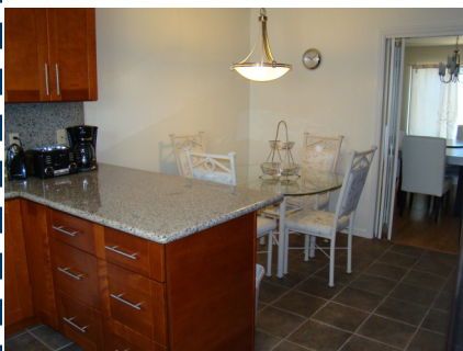
Kitchen at Freedom House

Freedom House has been actively updating its supporters on its Facebook page.