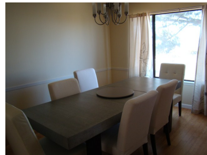
Dining Room at Freedom House

Also a monthly donor subscription makes a great Christmas gift for family or friends!